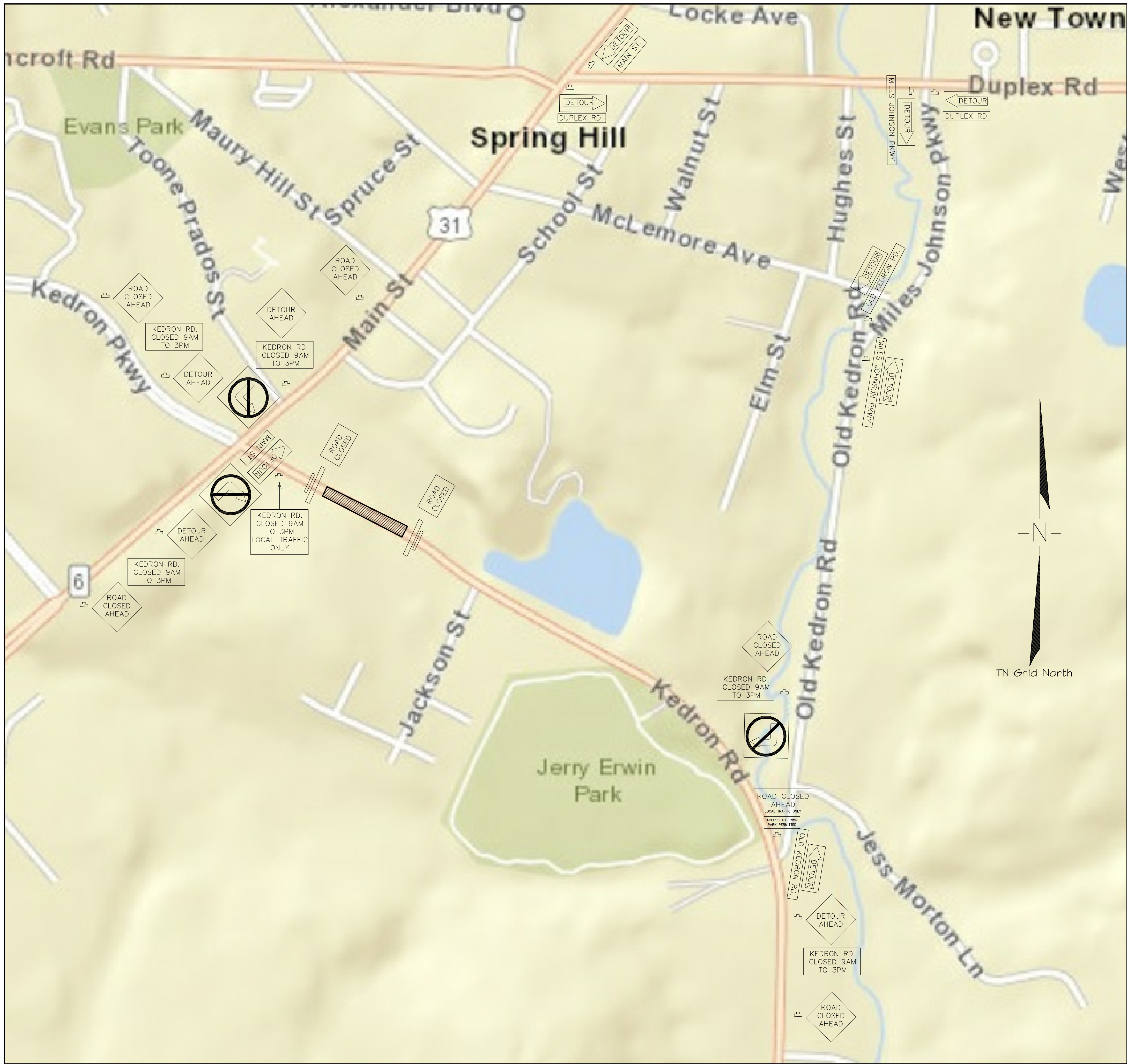
1 SITE LAYOUT C1 1:20